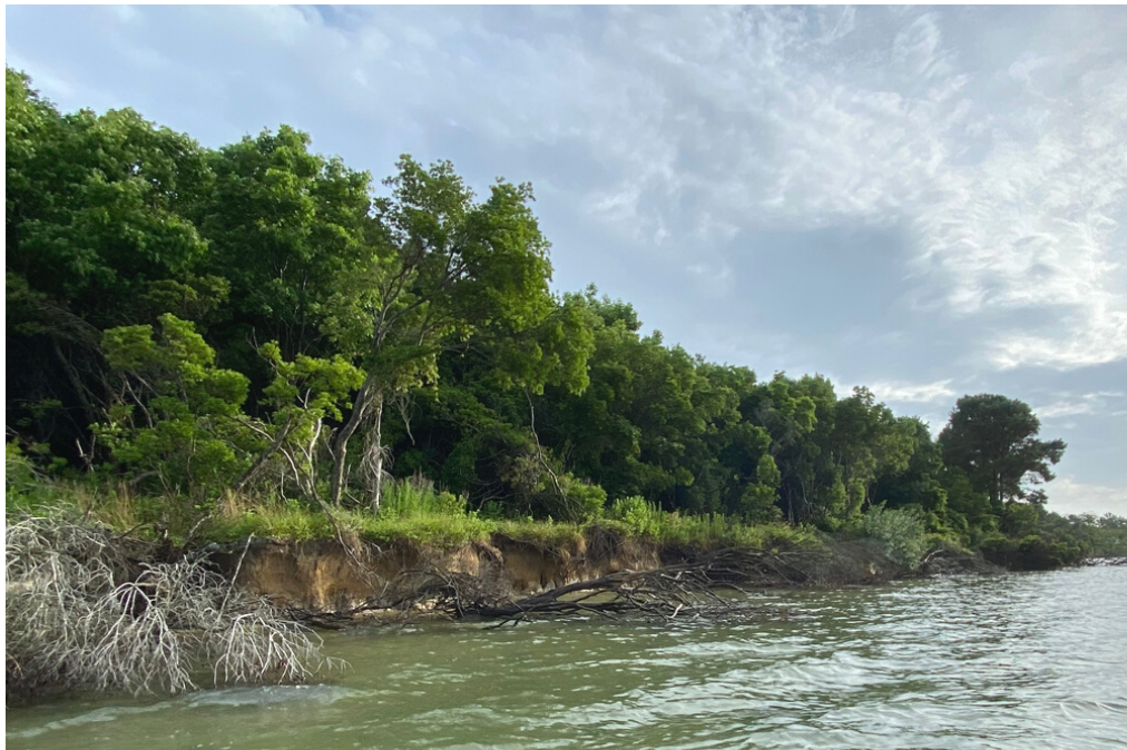
Erosion impacts at the shoreline.

boulder, serve to break up incoming wave energy, thereby reducing erosion and preserving important maritime habitat. The configuration of these headlands will be designed in such a way that allows the shoreline to naturally mature into a healthy tidal wetland. The project will restore approximately 1,800 linear feet of rapidly eroding shoreline on Sinepuxent Bay. At the completion of the project, shoreline and nearshore and upland maritime forest habitat will be enhanced for species, including diamondback terrapin, horseshoe crabs, and numerous shorebirds, that migrate and nest throughout the area for years to come.