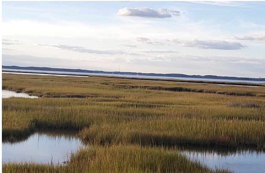
Overlooking a marsh in Maryland's Coastal Bays.