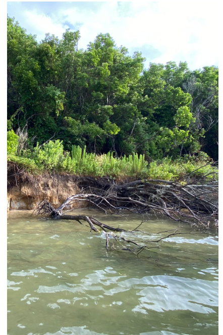
Tree fallen into the bay along the maritime forest trail.

The Maryland Coastal Bays Program, the National Park Service, Assateague State Park, Rum Pointe Seaside Golf Links, Underwood and Associates, and the Environmental Protection Agency are working together to address the area's adverse impacts. A regenerative resiliency design will be used that implements the strategic placement of vegetated headland structures to allow for the accretion of sand, long-term maintenance of habitat, and storm protection. In total, four headlands will be created along this stretch of shoreline. The lima bean shaped headlands, comprised of sand, cobblestone, and