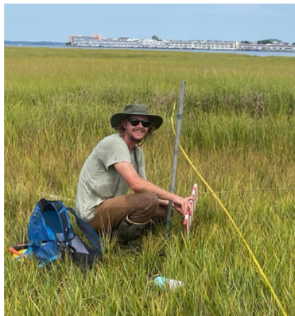
Assessing bayside wetlands in Ocean City.