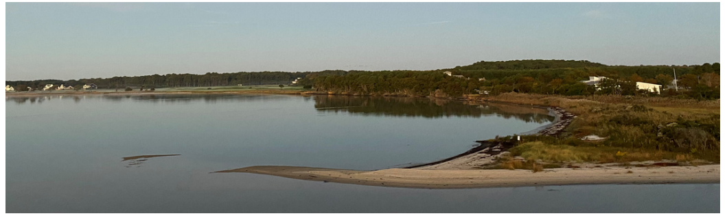
View from the Verazzano Bridge looking south at the shoreline.

Situated along the landward side of Sinepuxent Bay just south of the Verazzano Bridge is a shoreline bordered by maritime forest that many locals and visitors alike have come to cherish for its unique habitat and uncompromised views of Assateague Island. The site is adjacent to the Assateague Island National Seashore's visitor center, hosts a quiet public trail that meanders through maturing wax myrtle (the infamous "Tunnel of Trees"), and separates the Sarbanes Center and Rackliffe House from the bay. This particular site, though, is vulnerable to rising water levels and shoreline loss during storms and other high wind