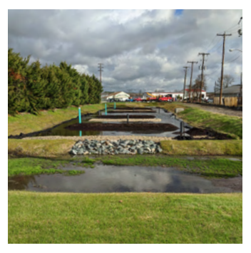
New sand-gravel wetland in Berlin designed to improve water quality.