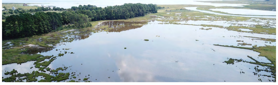
Tidal wetland loss at E.A. Vaughn Wildlife Management Area in Chincoteague Bay.

Challenges facing the Coastal Bays are common to many coastal areas. How these challenges are met have long lasting impacts. Consistent monitoring is necessary to determine the success of restoration projects and how conditions are changing within the watershed, but funding this activity is a challenge every year. Climate change and associated impacts present another challenge. Sea level rise, shoreline erosion, island and marsh loss, and rising temperatures, particularly high summer water temperatures, continue to damage seagrasses. Additionally, the area remains vulnerable to increasing extreme weather events. To address these challenges, continued resilience planning and implementation, and emphasis on renewable energy, need to continue on local and national levels.