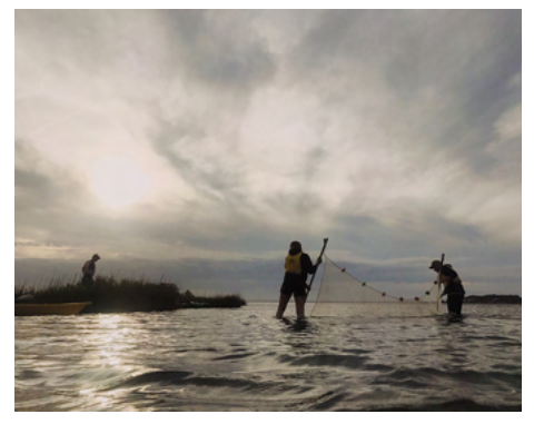
Sinepuxent Bay had the highest score of any region, a B.

Scores for hard clams were very good in St. Martin and Isle of Wight, good in Sinepuxent, moderate in Assawoman, and very poor in Newport and Chincoteague.