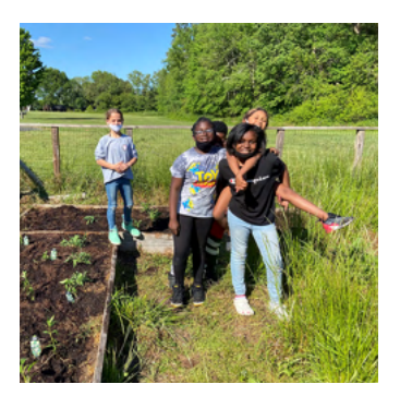
Students spend the day exploring and learning about the lower shore.

The Protectors of the St. Martin River worked to improve the health of the St. Martin River by growing oysters, providing assistance to MCBP's oyster gardening program, and donating oysters for use at MCBP's restoration sites.