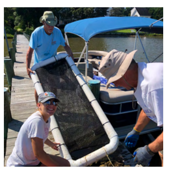
Protectors of the St. Martin River assess farmed oysters on the dock.