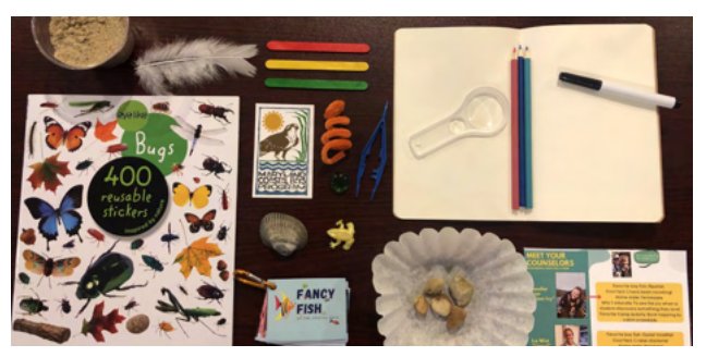
Various education items that went into the activity boxes for MCBP's virtual youth program "Bring the Bays Home".

The COVID-19 pandemic has impacted life for all of us. The initial shutdown caused national and state parks to close for a time, homes to be transformed into offices, and halts placed on the analysis of samples. MCBP science staff adapted as strategically as possible and were able to continue their monitoring schedule. The education team worked to design virtual programs and interactive learning opportunities. They developed lesson plans for educators, activities for youth, informational materials geared towards watershed residents, and "ask the experts" videos for people of all ages with the goal of connecting our coastal world to everyone in our locked down communities.