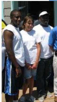
Coastal Stewards with 1st District Congressman Frank Kratovil.